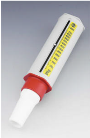
Old version scale (White text on black background)

If you have a Mini-Wright, the EU scale will be a different colour - blue text printed on a yellow background. Apart from the scale, the new Mini-Wright will behave and handle as reliably as the old meter.